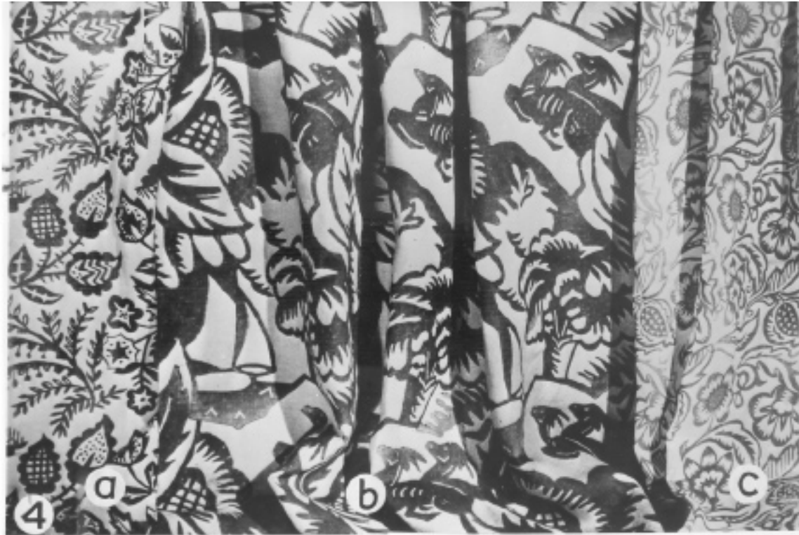
Figure 2. Ann Gillmore Carter, block printed textiles, c.1930