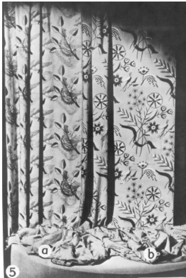
Figure 4. Ann Gillmore Rees, page of illustrations, Correspondence Course in Colour and Design , Society of Arts and Crafts of NSW, 1946.